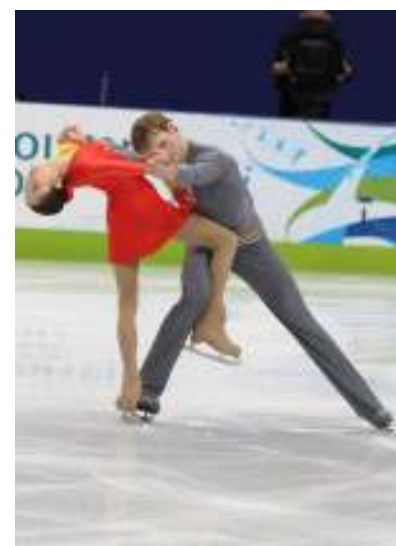
Body Movement Transitions