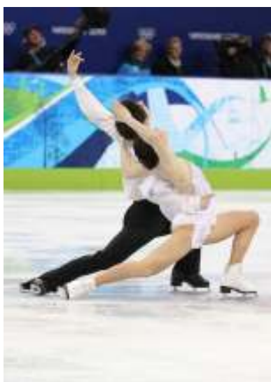
Skating Movement Transitions