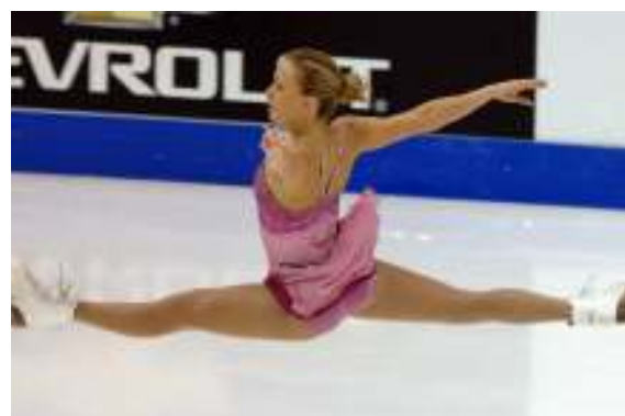
Non-Listed Element Transitions